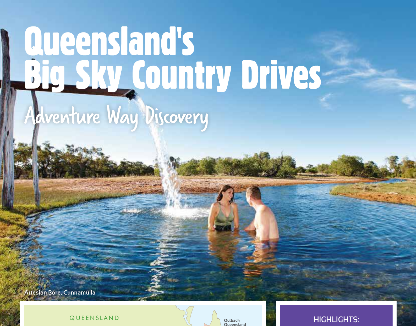
Artesian Bore, Cunnamulla