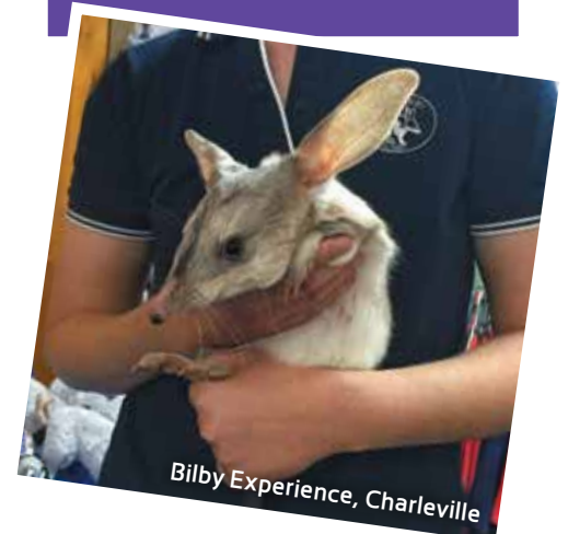
Bilby Experience, Charleville