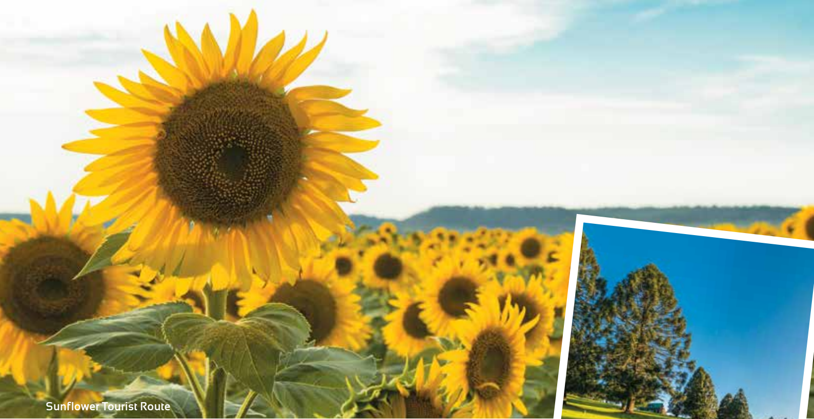
Sunflower Tourist Route