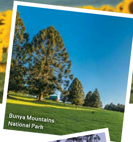
Bunya Mountains National Park

Travel down the Bunya Highway to Kingaroy and Taste South Burnett, a one-stop shop for locally produced wine, cheese and fudge. Visit the Kingaroy Observatory to view the real surface of the Sun by day and the starry constellations by night. Indulge with a gourmet platter at Crane Wines, a rustic cellar door perched high on the Booie Range with breathtaking views east over the valley. Your final leg of the drive will travel through the timber town of Blackbutt and the country township of Woodford back to Brisbane.