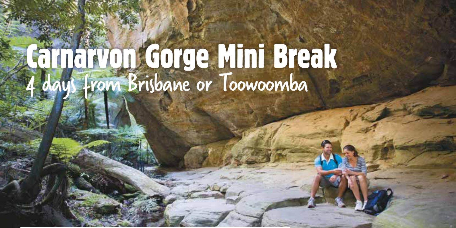
Carnarvon Gorge National Park