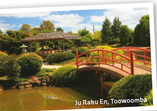
Ju Raku En, Toowoomba

Overnight Quest Apartments or Potters Boutique Hotel, Toowoomba