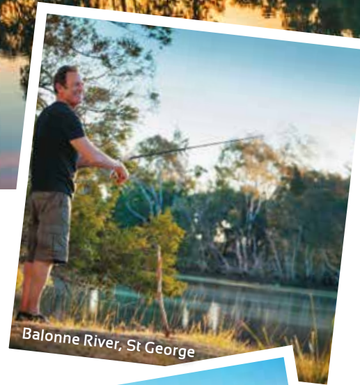
Balonne River, St George

Take a scenic drive through the Toowoomba highlands to the picturesque villages of Highfields, Hampton and Cabarlah. Wander the enticing specialty, arts and crafts shops, purchase seasonal produce and share a meal in a cosy café. Breathe in the panoramic views and enjoy a picnic at Ravensborne National Park. Follow the scenic country drive via Esk back to Brisbane.