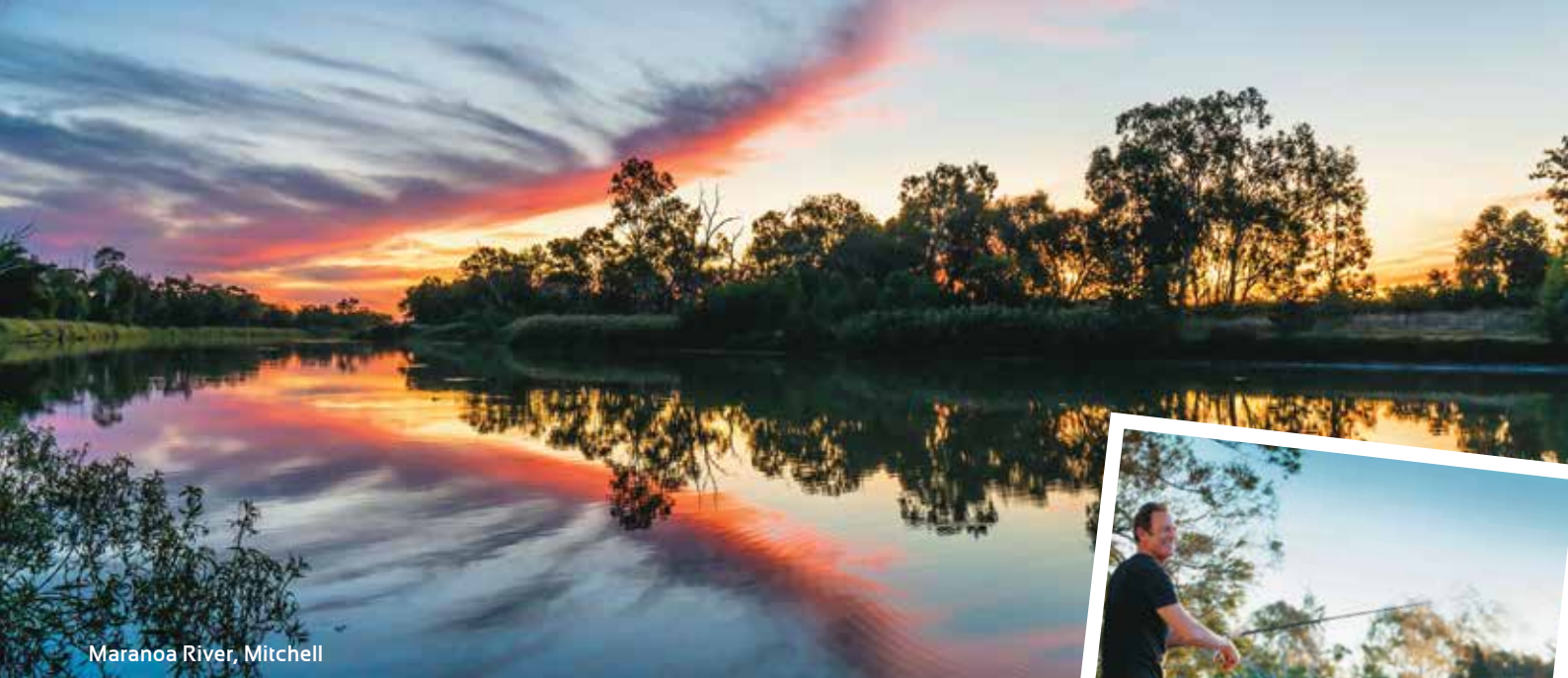
Maranoa River, Mitchell