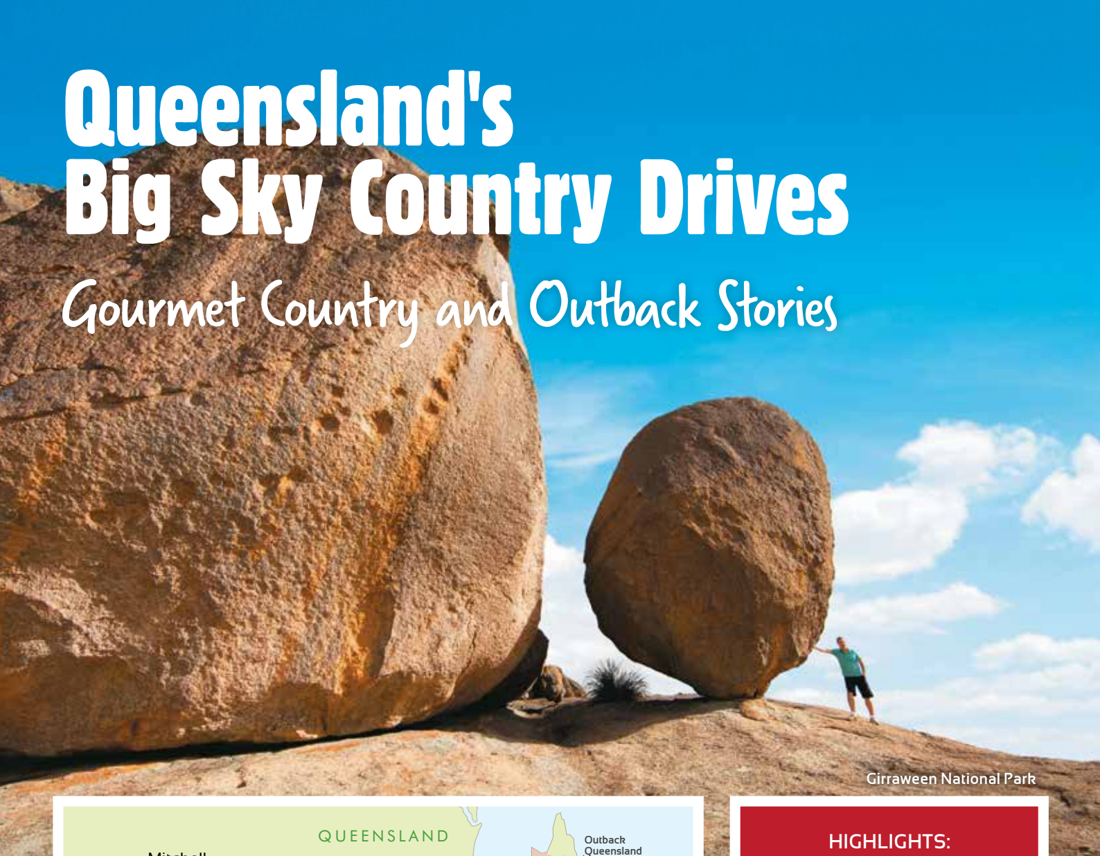
Girraween National Park