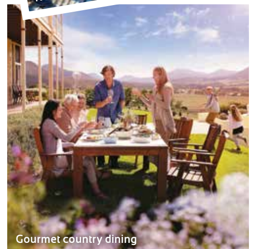
Gourmet country dining