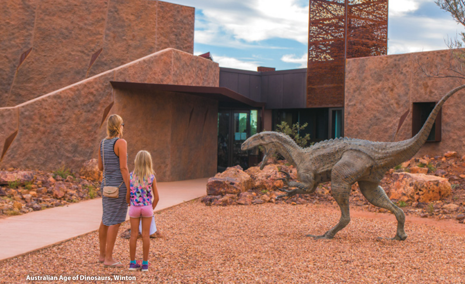
Australian Age of Dinosaurs, Winton

'vanishing' species. Pick up a cruiser bike, explore town or head to the local pool to cool off.