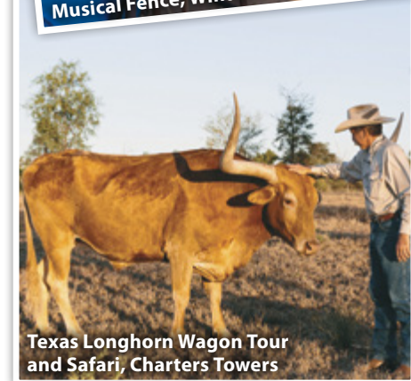
Texas Longhorn Wagon Tour and Safari, Charters Towers