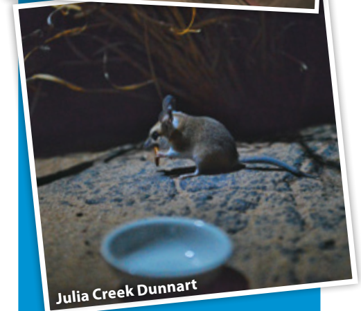
Julia Creek Dunnart