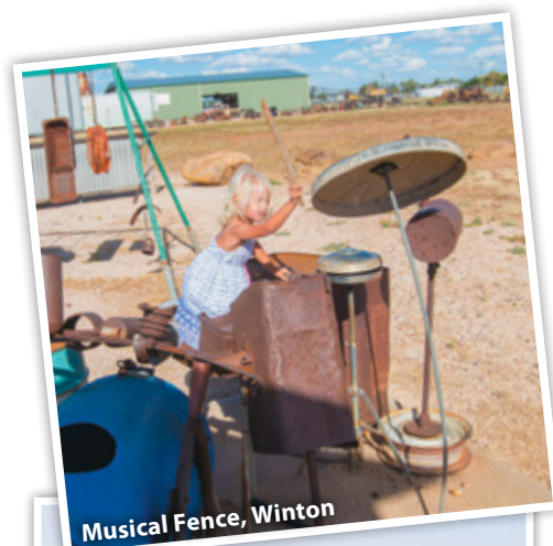
Musical Fence, Winton

With the western sun in your rear view mirror, make the last leg of the drive back to Townsville. Oh, and if you missed the original Woodstock and always wished you'd been, here's your chance to take a rest break just after the half way mark at Australia's very own namesake town.