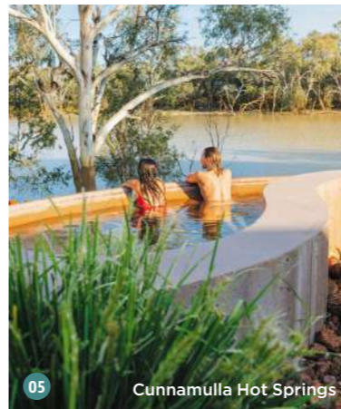
05 Cunnamulla Hot Springs