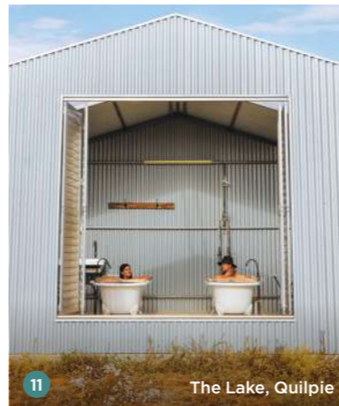
11 The Lake, Quilpie