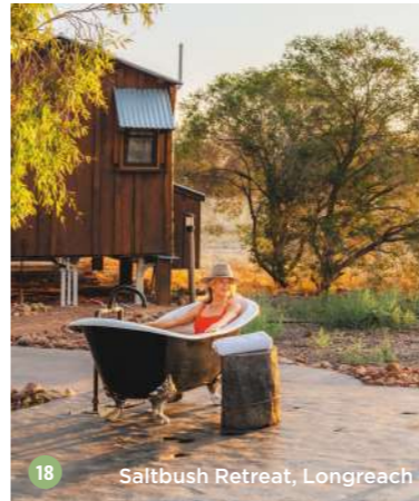
18 Saltbush Retreat, Longreach